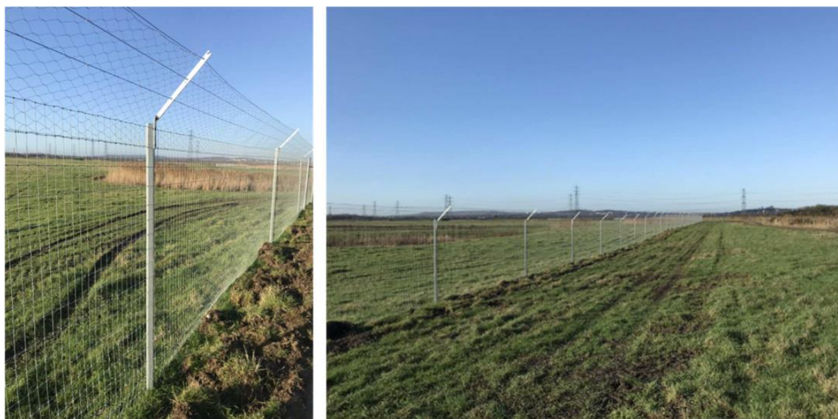
Figure 1.2 Example Predator Exclusion Fence