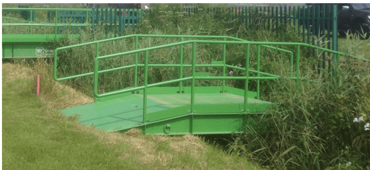
Figure 1.3 Indicative Temporary Ditch Crossing Bridge